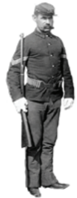
A Cavalry Sergeant circa 1886

Wikipedia is a free site which offers an alphabetically sorted collection of uniform data for many countries and branches of service at http://en.wikipedia.org/wiki/Category:Military_uniforms . Pictures are plentiful and available for public use.