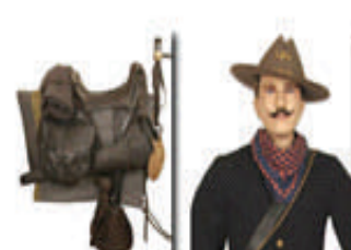
1898 CAVALRYMAN SPANISH AMERICAN WAR