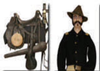
1896 CAVALRY OFFICER SPANISH AMERICAN WAR

Many areas of the country have military museums with actual uniforms on display. It is striking to see how small the early American soldiers were. Many uniforms were no larger than clothing for present-day children of ages 10-12. A museum in Wyoming has a very informative website at http://www.militarymemorialmuseum.org/ . This site contains many photographs of their collection, and has detailed information about Cavalry uniforms, including saddle descriptions.