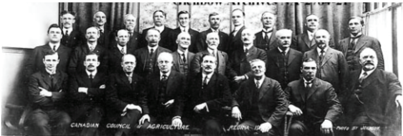
Regina, Saskatchewan, 1917, Courtesy Glenbow Museum

While many Discovery Portal resources are available at no cost, some links will require membership in Early Canadiana Online, a service with a $100 per year subscription fee. The portal will provide sample pages from the Early Canadiana materials, but the full collection is found at http://eco.canadiana.ca . There is a great deal of material here on the Hudson's Bay Company activities in North America and there are 73 volumes of the annual missionary reports from Jesuits in New France sent back to their superiors in France – with lots of references to early settlers in Quebec and the St Lawrence River drainage.