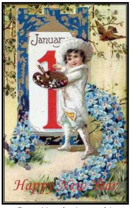
Best of Wishes for 2004!