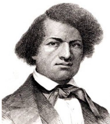
U.S. History Images

Frederick Douglass raised consciousness and hackles when he came to Paisley, Scotland.