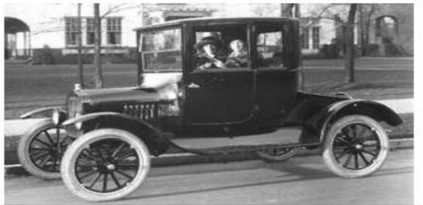
1920 Coupe

I know so much more about this family and their lives than by using the census alone. I had a lot of fun and I am sure that you will too.